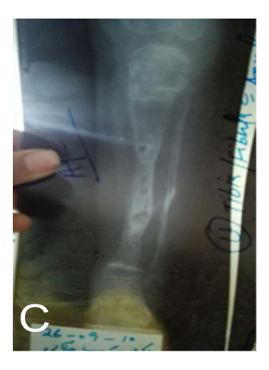
Figures: Radiograph before, during and after management with Ilizarov

(A): Fractured at presentation (B): Treated with Ilizarov (C): Ilizarov removed after consolidation