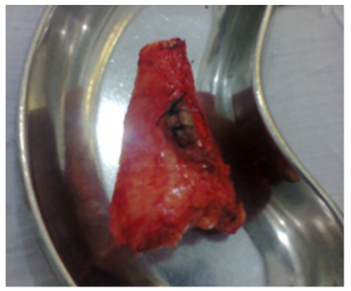
After tumor resection