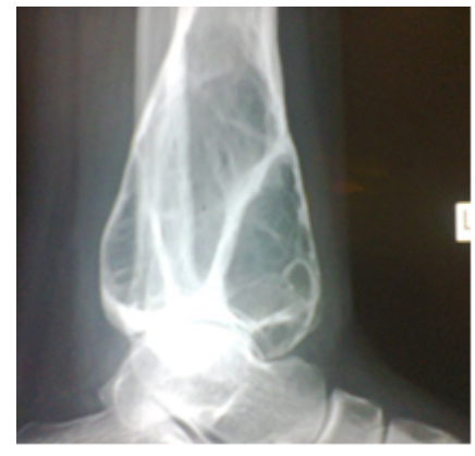
Lateral view. Distal tibia GCT

Case I: Giant cell tumor of distal tibia.