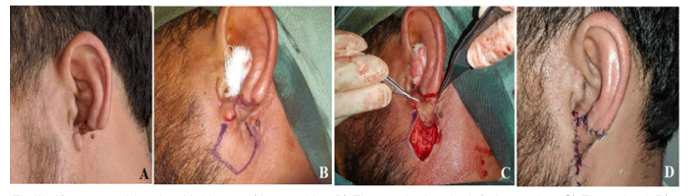
Fig III: A) 35 year old male with history of human bite. B) Flap marked at the inferior portion. C) Flap raised. D) Postoperative appearance of the flap.

deficiency. Maral T et al successfully used a Y-V advancement flap of the anterior and posterior parts of the cleft to reconstruct the cleft. Borman H